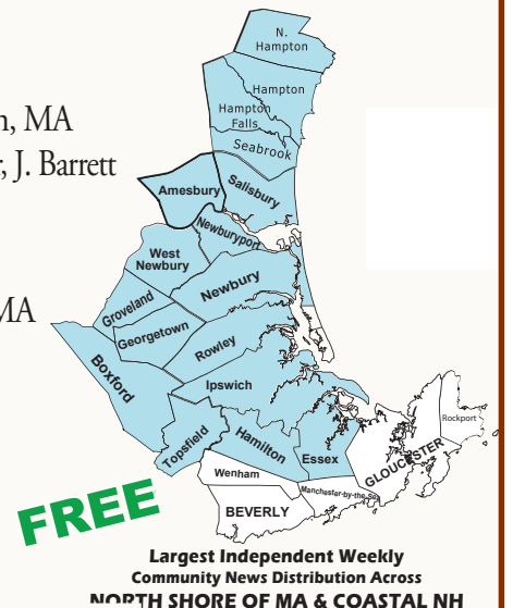
Largest Independent Weekly Community News Distribution Across NORTH SHORE OF MA & COASTAL NH

Join the 2026-2027 Publisher's Club. Your name or business name published in 52+ editions from date of joining. See form on page 5.