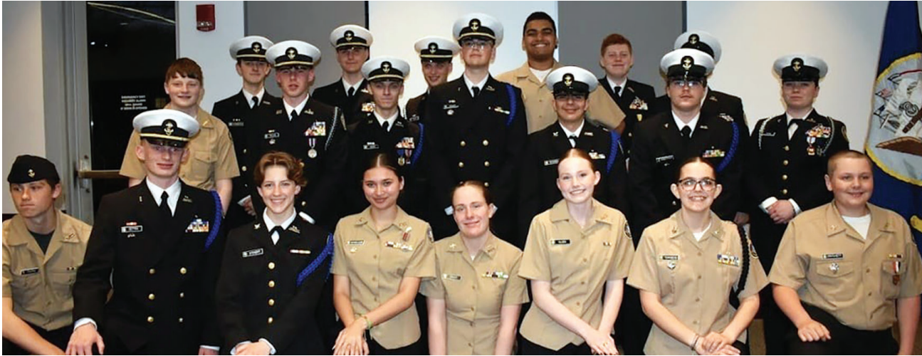
Dover High School's NJROTC cadets.