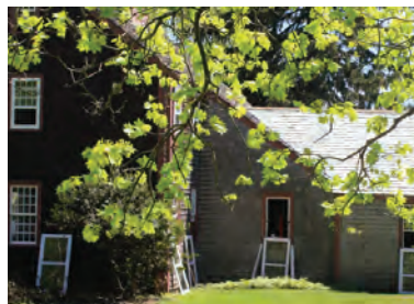
The burned back half of the historic home at 7 Lower Green.