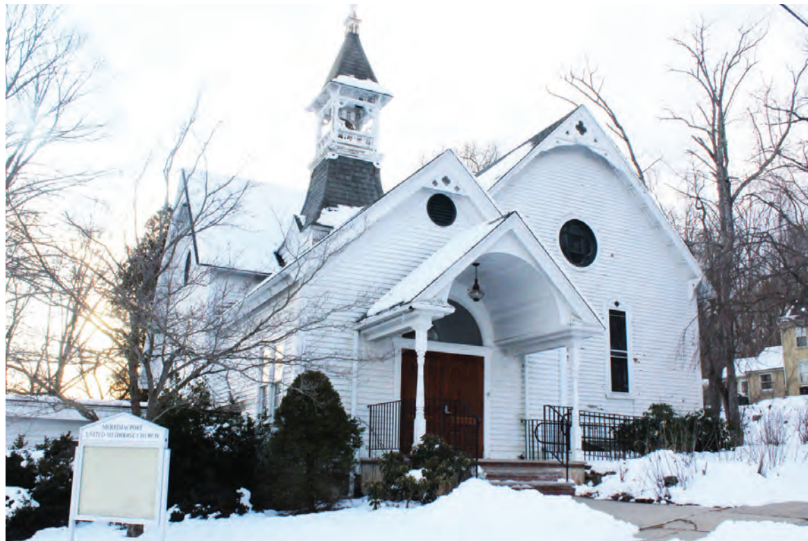
The Merrimacport Methodist Church

“With sweeping views of the river, this landmark invites you to bring your vision -- and your architect -- to transform it into a one-of-a-kind single-family home. The soaring architecture, character details and dramatic presence provide the perfect backdrop