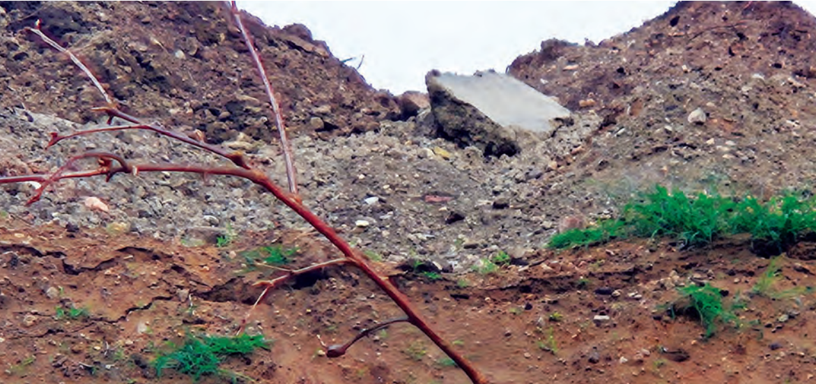
Photograph of unknown materials neighbor observed at the site. (courtesy photo)

Shown below is one such photograph provided to The Town Common by a neighbor to the site. In a letter to the town's planning board, Peter Durling of Verril-law.com out of Boston stated that his client, the excavator Todd Champlain was involved with "soil enrichment activities he is performing at the Zibell Farm located at 214 North Street in Georgetown (the "Property"). The activities consist of topsoil and subsoil sand removal and replacement with higher nutrient organic compost and soil in order to improve crop yield to support an organic farm on existing agricultural land." ♦