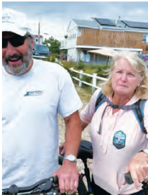
Byfield residents: "We love it. Our first year on bikes."