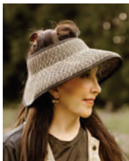
by Ida Wye