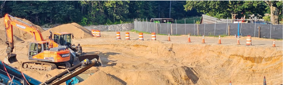
Photograph of portion of the excavation site