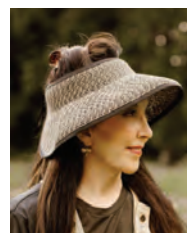
by Ida Wye

Essex Tech accomplished a real milestone this spring when there nascent Maplewood Arboretum was certified. This remarkable achievement for a public education institution will inspire and educate the present and future students and the collection of trees will increase as the years advance.