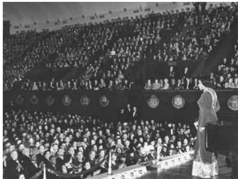
Marian Anderson Performing in Constitution Hall, 1943

Arrangements entrusted to Solimine Funeral Homes, Lynn.