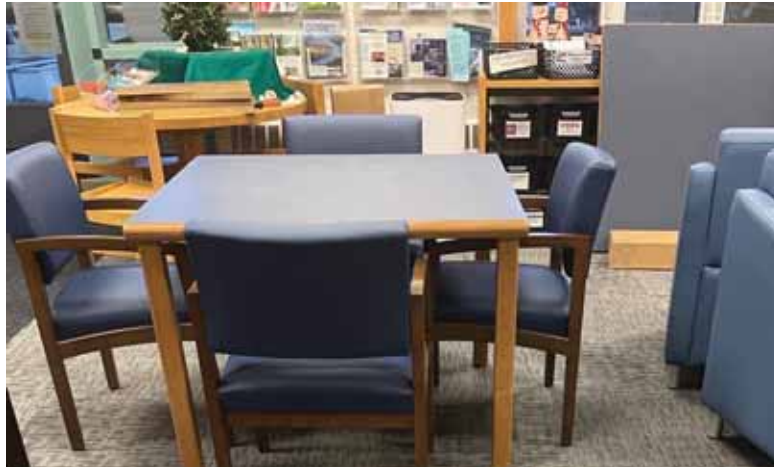
Groveland's Langley-Adams Library