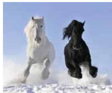
Everyone Enjoys Winter Fun!