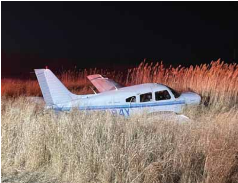
A single-engine Piper Warrior airplane that came to rest on its side and off the runway after clipping its wing on a fence while landing at the Plum Island Airport on Friday evening.

The airport was closed for the night. The Federal Aviation Administration was notified of the incident. ♦