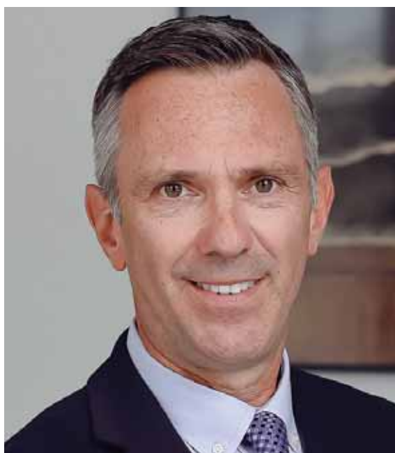
BY J. PETER ST. CLAIR, DMD

As with many aspects of life, people often seem "pre-programmed" about what to expect in a dental office. I, and most of the dentists I know in this area, believe the philosophy of practice revolves around treating the person as a whole, and not just a tooth. It means patients, their overall health & well-being, must be foremost in the practitioner's mind. Yes, it also means cleanings, fillings and crowns. These are often inescapable outcomes to dental