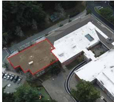
Aerial view of Harry Lee Cole Elementary School with roof section highlighted in red