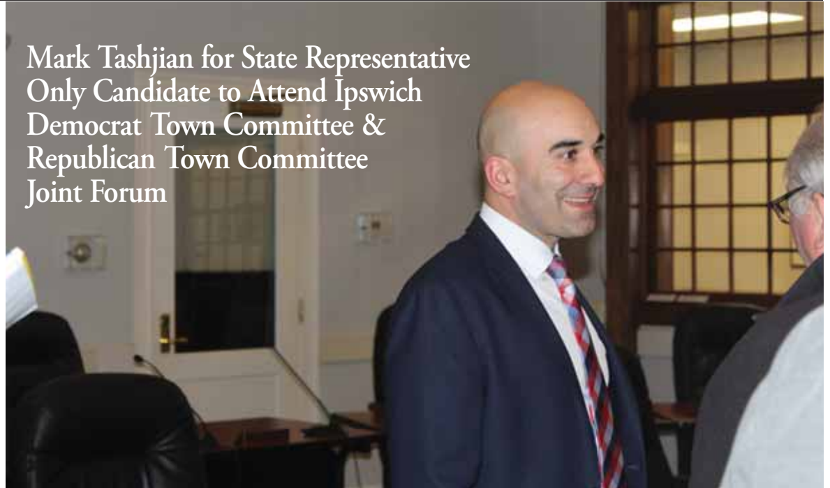
Republican State Rep. Candidate Mark Tashjian at local forum