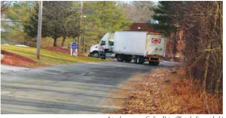
A truck on narrow Carlton Drive

Don't miss what's going on in your community! Sign up for The Town Commons weekly e-mail! Visit thetowncommon.com and sign up today!