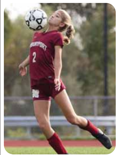
Girls Soccer Season is in Full Swing as Newburyport Freshmen Face Off Against Masconomet Recently