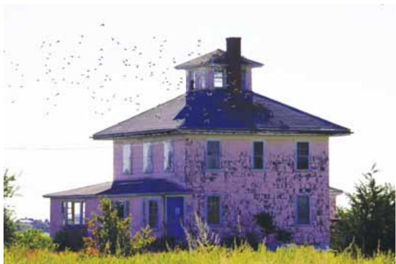
The Pink House