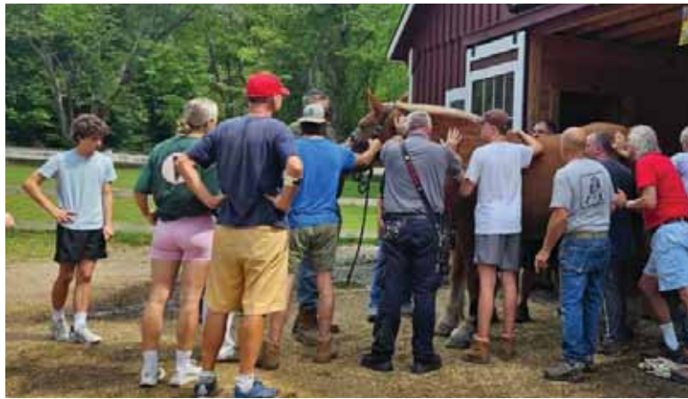
West Newbury firefighters and equine rescue personnel worked to rescue an 1,800-lb. Belgian Draft horse named Summer.