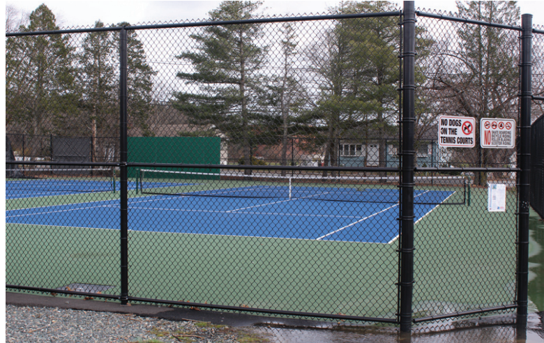
The tennis court at Nock Middle School