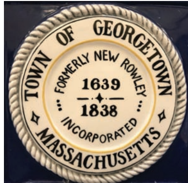
Town of Georgetown Seal