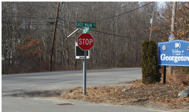
Georgetown Welcome Sign