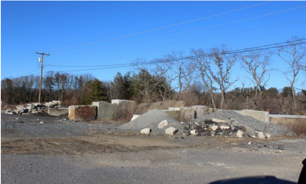
Trader Alan's site today as seen from Pond View Ave. in Amesbury.